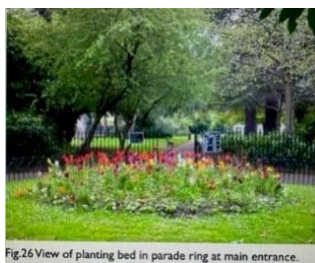
Fig.26 View of planting bed in parade ring at main entrance.

There were 7 planted flower beds and now only 1 remains. This constant attrition of the historic features of the Park is lamentable.