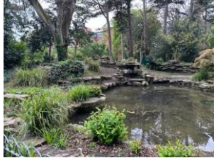
Photograph 2023 of stagnant pond with waterfall not operational