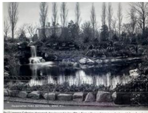
Photograph showing waterfall in operation.

Please note that the railing installed in the last few years is only the lower level section. The original railing was approximately twice that height as shown in this photograph.