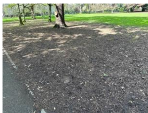
Photograph 2023 of current condition of grass as we approach summer.