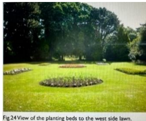
Fig.24 View of the planting beds to the west side lawn.

It is regrettable that the bark mulch was not located in a less trafficked area and not near the playground.